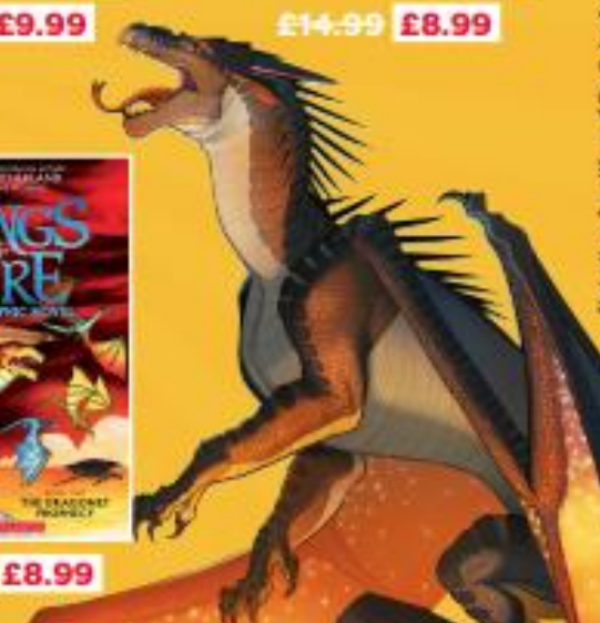
Illustration from Wings of Fire © Julia Aerts 2023